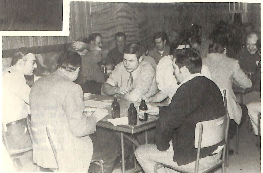
Some very serious reminiscing at the Smoker gathering